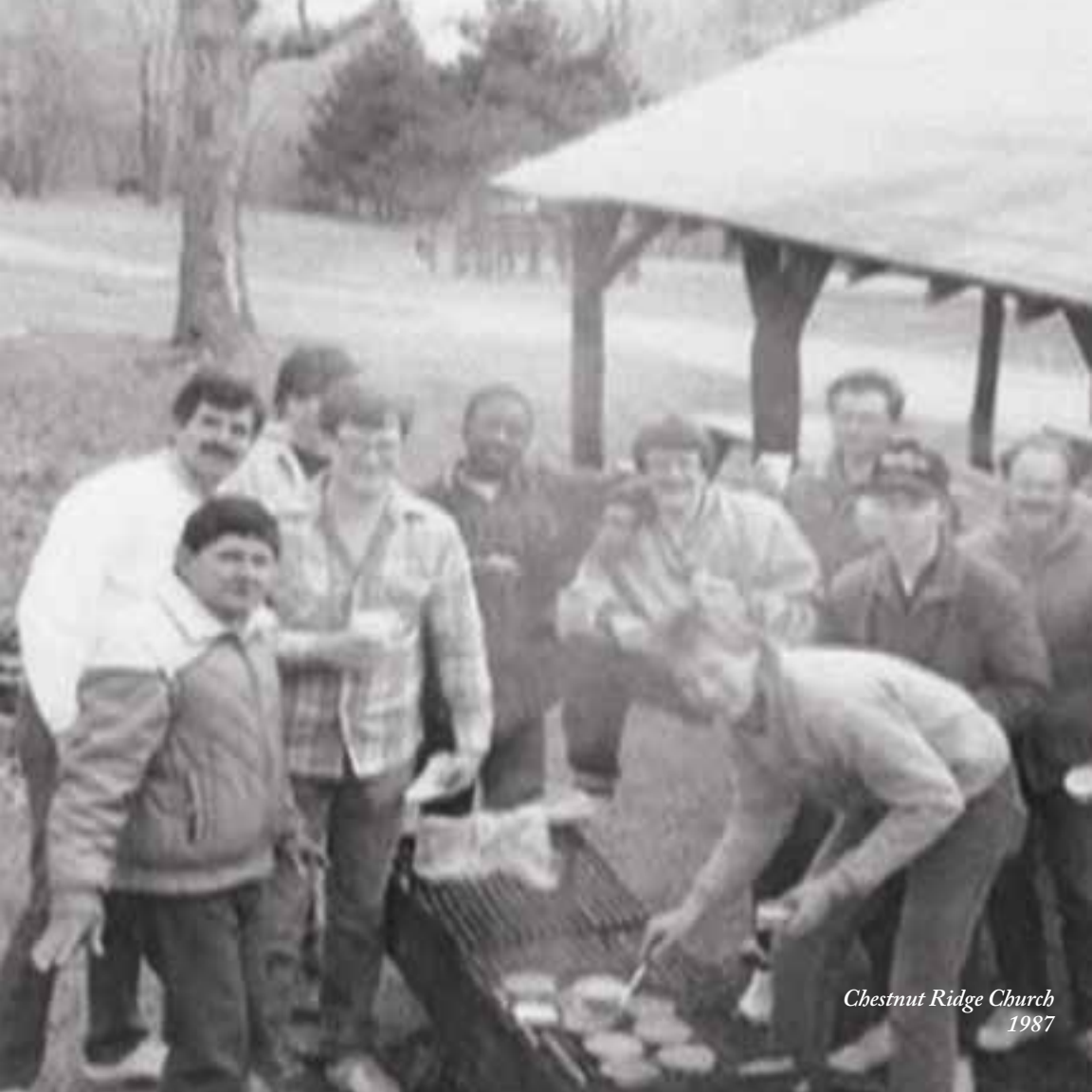
Chestnut Ridge Church 1987